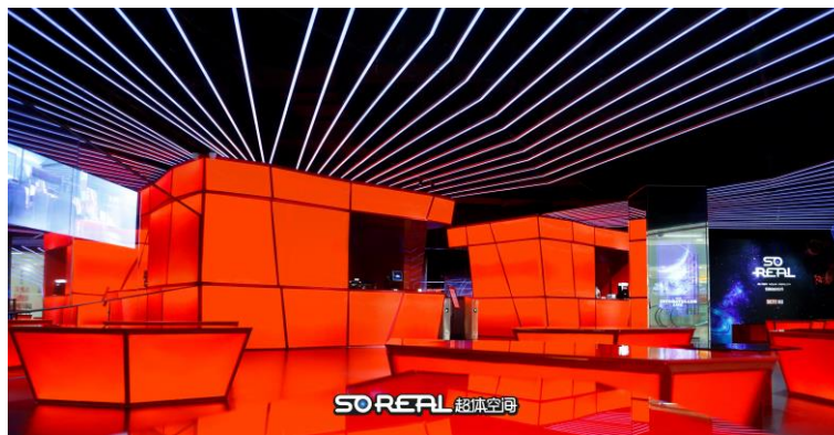
SoReal VR Theme Park in Beijing