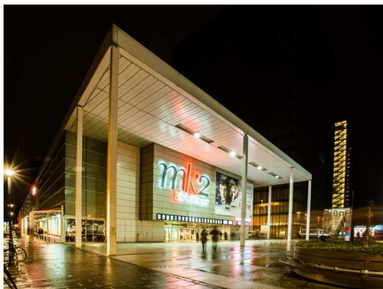
MK2 Bibliothèque in Paris